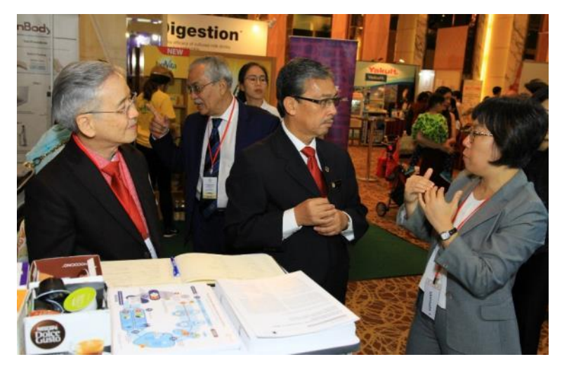
Nestle Products Sdn Bhd