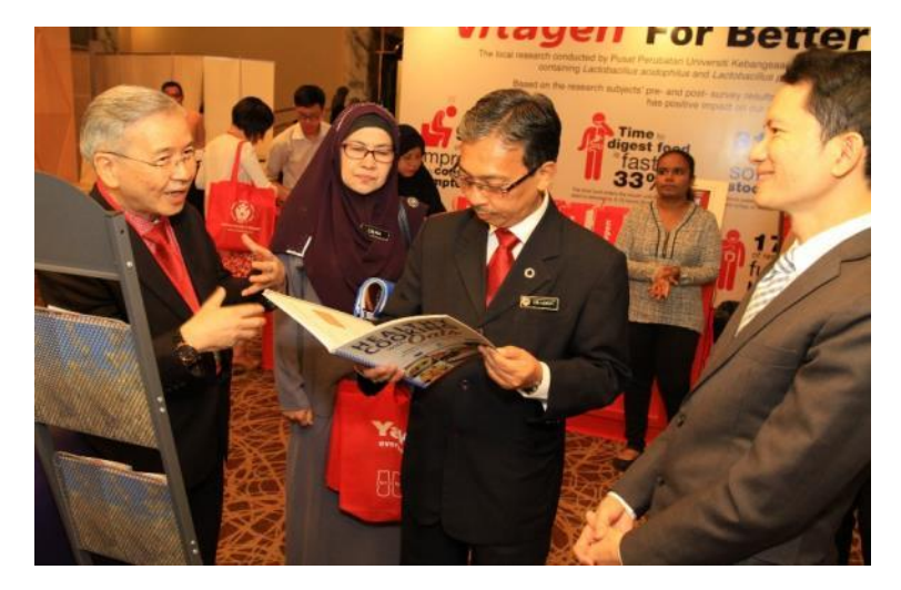
Pepsico (Malaysia) Sdn Bhd