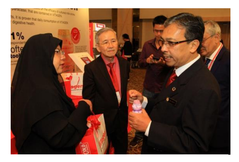
Cotra Enterprises Sdn Bhd (Vitagen)