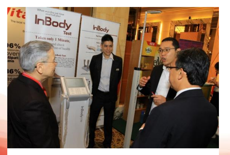
InBody Asia Sdn Bhd