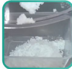
Spray Drying Powder