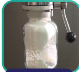
Palm-based Powder from Spray Drying