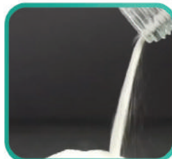
Spray Drying + Fluid Bed Drying Powder