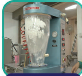
Palm-based powder from Fluid Bed Drying