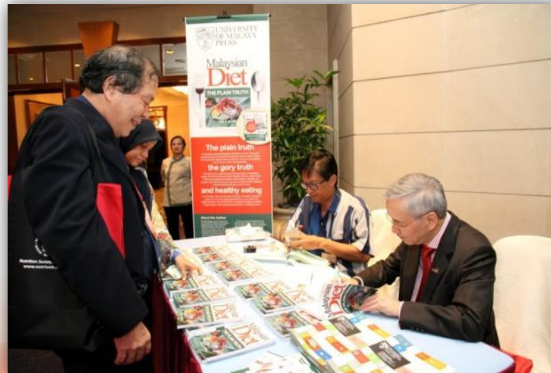
University Malaya Press