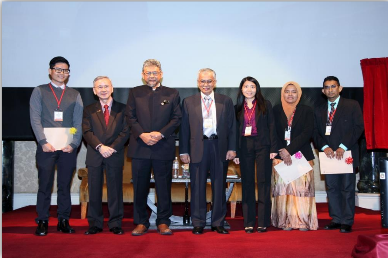
Group Photo with Fonterra Rep (Sponsor) & Recipients of NSM Publication Prize