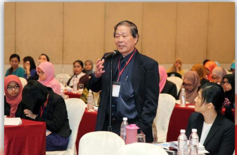
Q & A Session