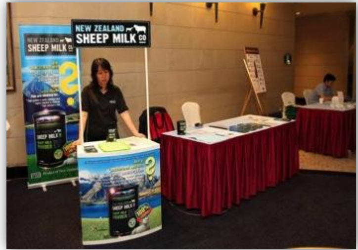
Blue River Lifestyle