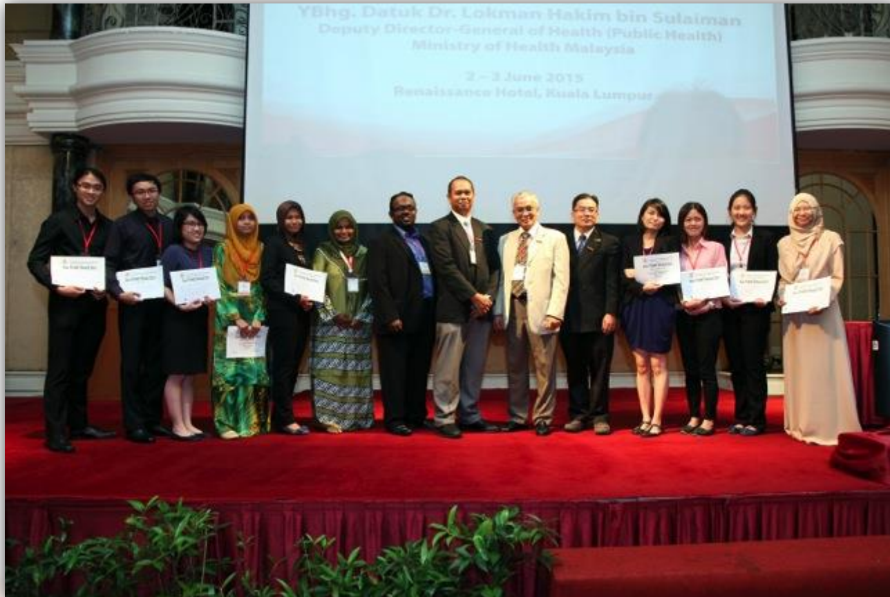
Group Photo of Judges & Recipients of Poster Presentation Prize