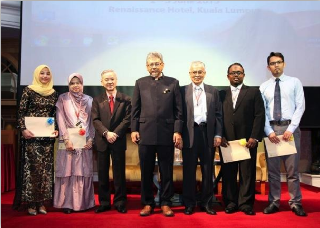
Group Photo with Recipients of Post-Graduate Prizes