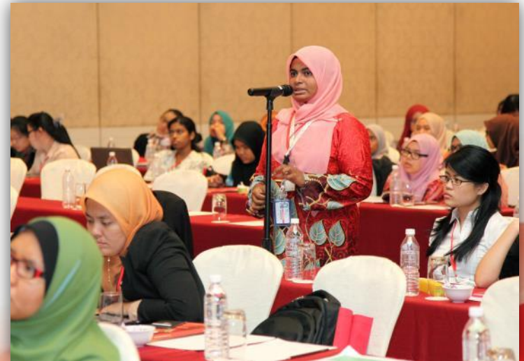
Q & A Session