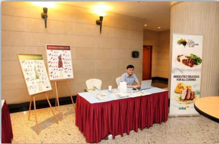
Meat & Livestock Australian