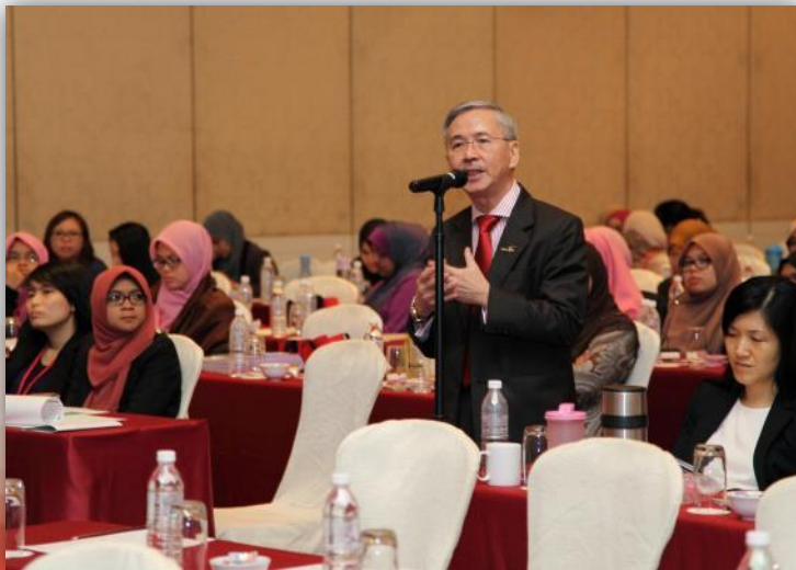
Q & A Session