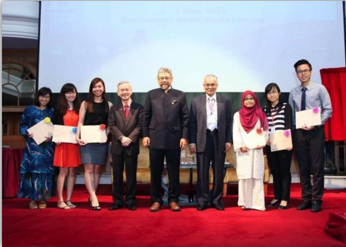
Group Photo with Recipients of Undergraduate Prizes