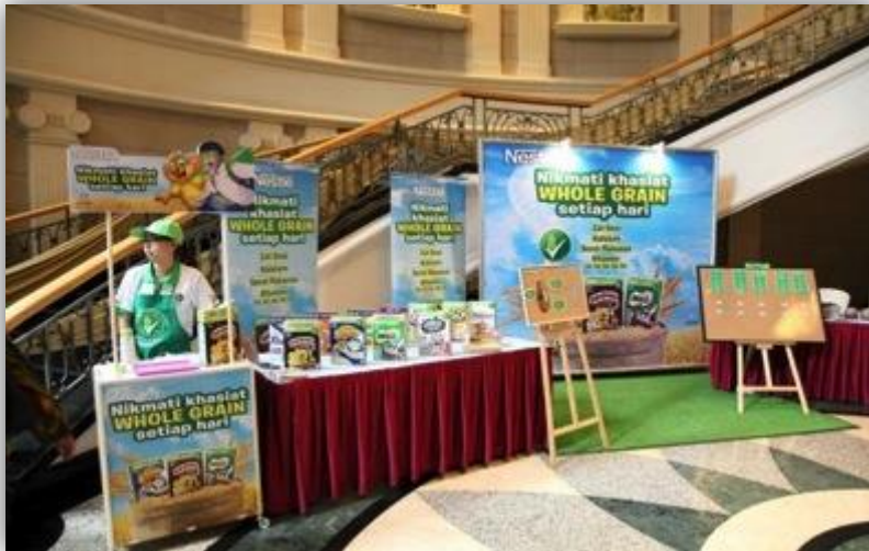
Cereal Partners Malaysia