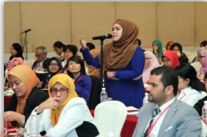
Q & A Session