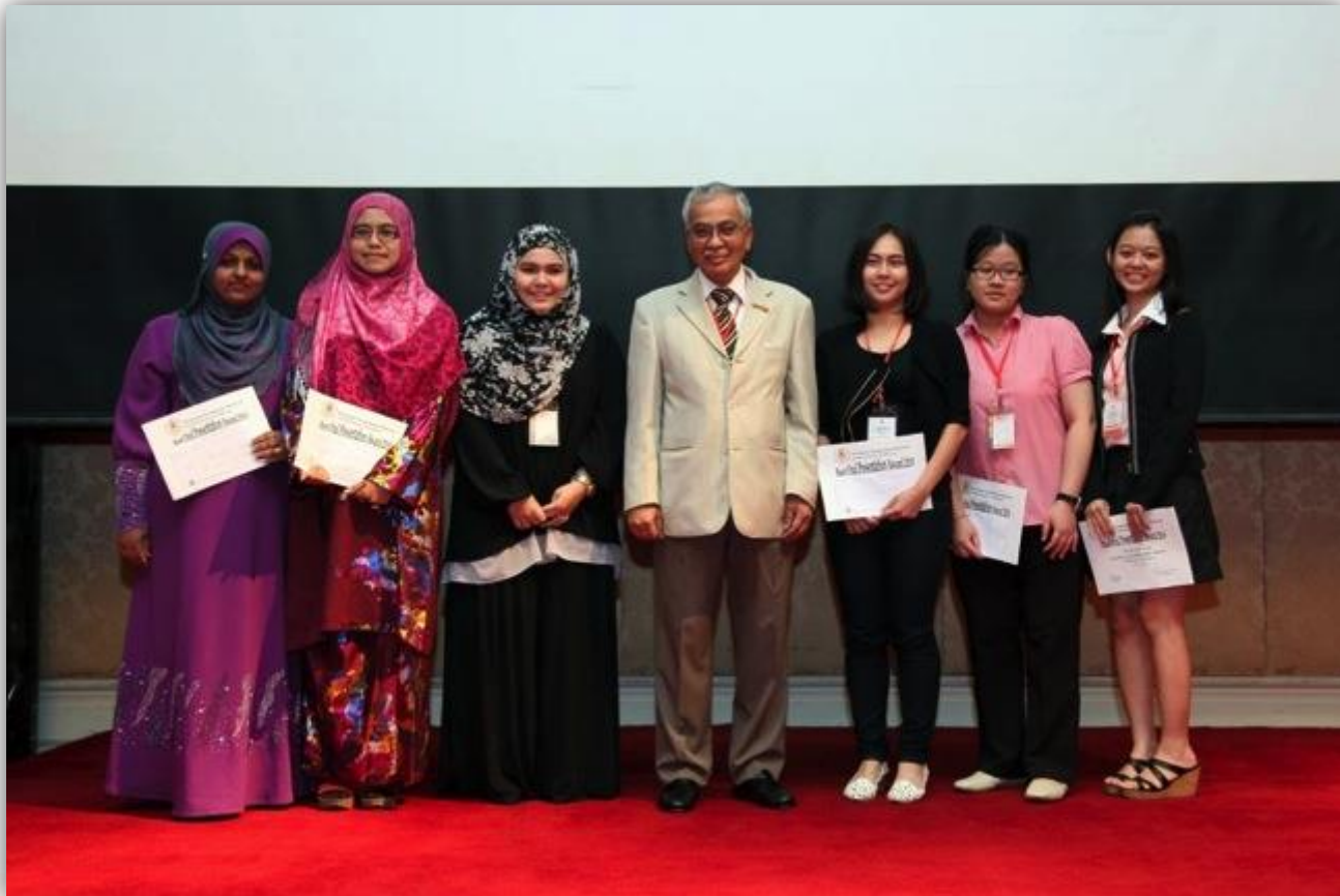
Group Photo of Judges & Recipients of Young Researcher's Symposium Prize