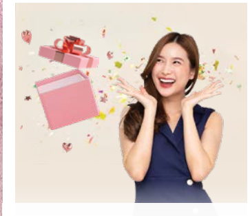
Access to member-only specials and exciting prizes.