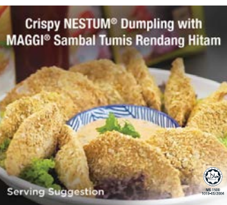
Exclusive recipes curated by chef and special guests.