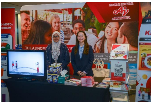
Ajinomoto (Malaysia) Berhad