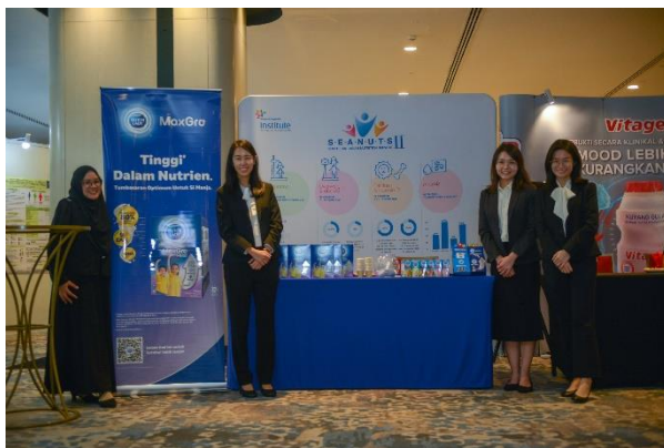
Dutch Lady Milk Industries Berhad