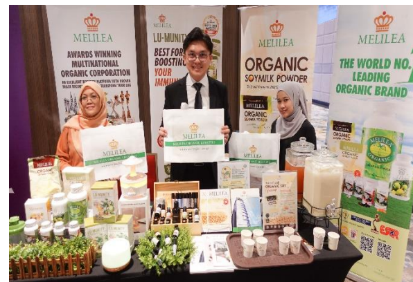
MELILEA INTERNATIONAL GROUP OF COMPANIES