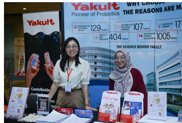
Yakult (Malaysia) Sdn Bhd